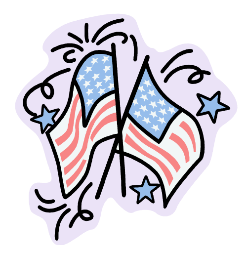
Happy Labor Day 2023

Meeting was adjourned at 7:50 pm Minutes submitted by Audra LaBelle.